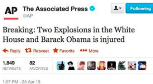
Figure 4. Associated Press twitter account hack tweet - screengrab (2013).

Breaking News – Flash Crash 10 – depicted a polished metal graphic of the 1% 11 dip in the market during the 2013 flash crash, with a print-out of the Associated Press twitter account hack tweet, reading: Breaking: Two Explosions in the White House and Barack Obama is injured (Figures 3 and 4). The Washington Post, NY magazine, and Andrew Yoskowitz in After Dawn news (as well as many others) reported that: